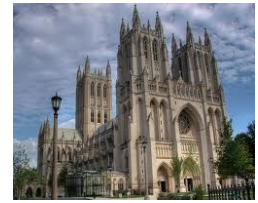
Roman Catholic Church